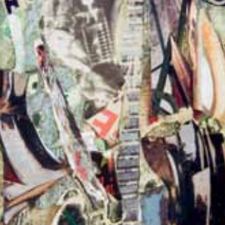
Will Ursprung Subliminal found papers and citrasolv® altered image on wood