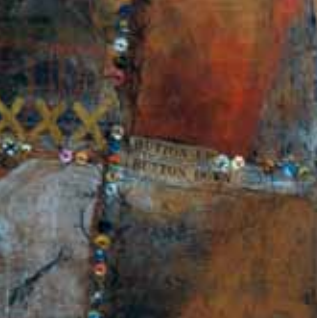
Ann Bellinger Hartley Button Up Button Down collage papers, acrylic and thread