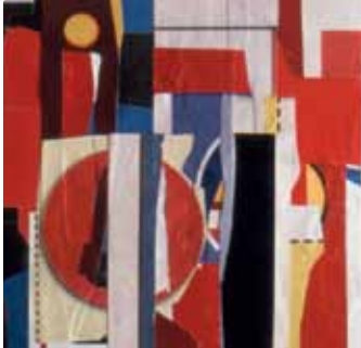
Milton Courtright Modern Myth #1 decoupage: various advertising papers