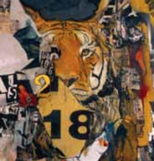
Will Ursprung Soliloquy found papers and acrylic on wood