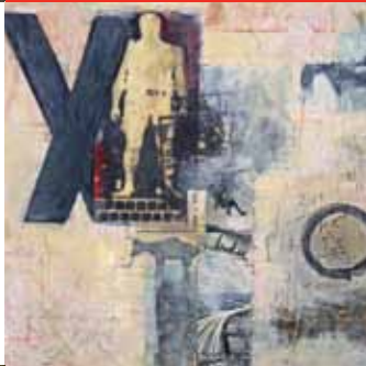
Suzanne Kueckelhan Traveling Man acrylic, maps, news paper, digital reproduced images, and various paper